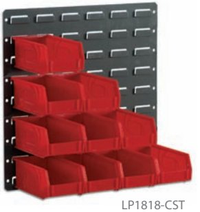
shown with PB74-3