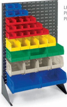
LPFS1-BST shown with PB54-3, PB74-3, PB105-5, PB108-7, PB1011-5 and PB1416-7

Boost workstation efficiency with LEWISBins+ Louvered Panel Floor Stands. Stands are available in single or double sided styles. Pre-configured systems with bins are available or bins can be ordered separately. Single sided Floor Stands hold up to 800 lbs and double sided Floor Stands hold up to 1,600 lbs. Optional Mobile Kits add instant mobility.