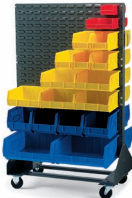
LPFS2-BST shown with PB54-3, PB74-3, PB105-5, PB108-7, PB1011-5, PB1416-7, and MK4000-B (mobile kit)

** Load Capacity, including bin weights.